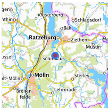
Location in the requested region