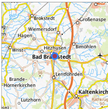
Location in the requested region