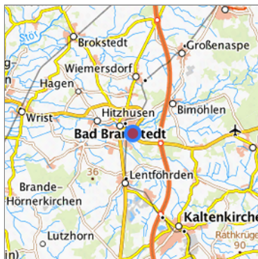
Location in the requested region