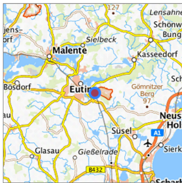
Location in the requested region