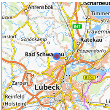
Location in the requested region