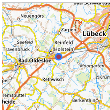
Location in the requested region