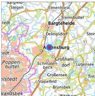
Location in the requested region